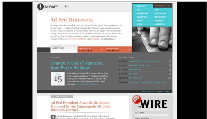
The AdFed website designed by Antidote X was honored by the Webby Awards in the category of Best Use of Typography.